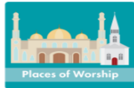
Places of worship or buildings rented for religious services