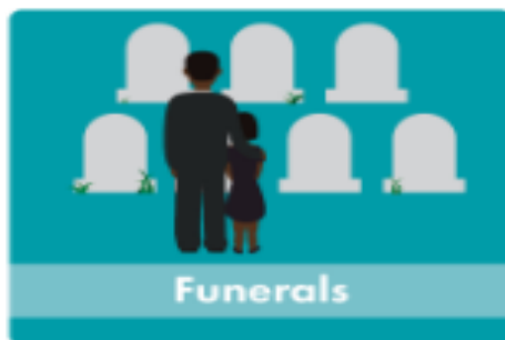
Public religious ceremonies, such as funerals