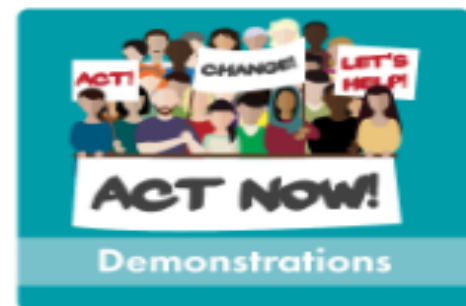
During a march, rally, parade or other public demonstration