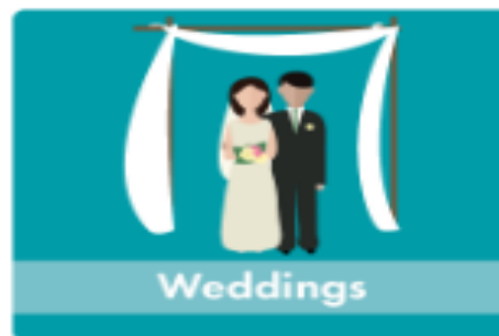
Public religious ceremonies, such as weddings